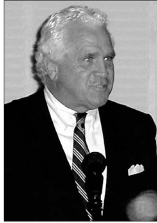
Hon. Thomas V. Mike Miller, Jr., President of Senate